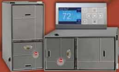
Model RGGE Downflow Model Model RGJF Horizontal Model Models up to 94.1% A.E.U.E.