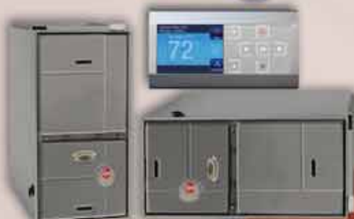
Model RGGE Downflow Model